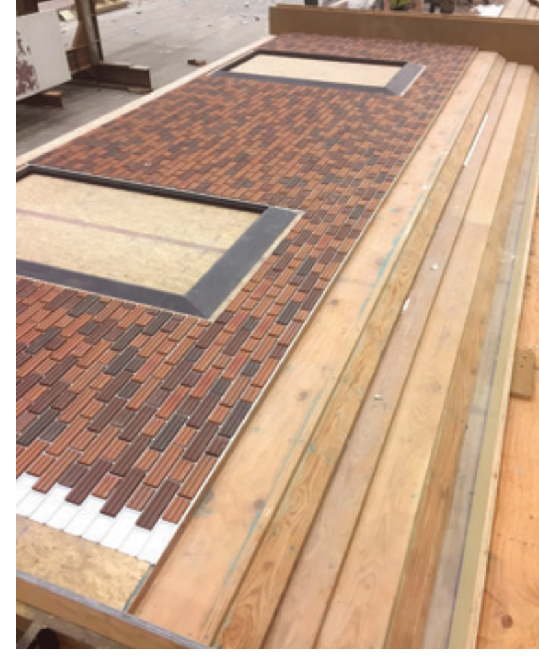
The casting of the wall panels for the Pioneer Hall project featured inset brick surrounding the 3-D printed blockouts that created the window shapes.

The one drawback, which will take some time to overcome, is the expense. The polymer material is more costly than other options, so the molds need to be used for components being replicated many times—ideally hundreds of times. That eliminates their use on many projects.