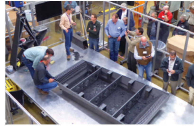
ORNL helped create the initial form designs and cast several iterations to find the best approach.