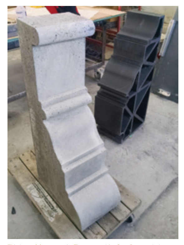
This insert (4) was cast by Thermawood for Gate Precast during a test of 3-D printed forms. The piece was set into a larger form to create the intricate face of a 1-ft-wide cornice, to see if it could replicate the actual 30-ft-long cornice installed on a Nordstrom store in New York, N.Y.