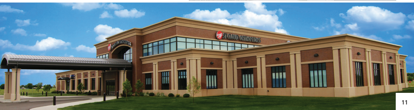
Pictured above: 6. Tria Orthopedic Center, Bloomington, MN; 7. Twin Cities Orthopedics, Waconia, MN; 8. Hudson Medical Center, Hudson, WI; 9. Mayo Clinic, Rochester, MN; 10. St. Alexis Medical Center, Minot, ND; 11. St. Cloud Orthopedic Center, St. Cloud, MN